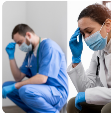
Figure 2 KEEPCARING The Project

The COVID-19 pandemic further intensified these stressors, revealing systemic vulnerabilities in healthcare systems across Europe. While some interventions to improve wellbeing and resilience exist, there is still a significant gap in understanding what combination of solutions works best, especially in high-stress, surgical environments. Many healthcare workers continue to experience job dissatisfaction, mental exhaustion, and disengagement from their roles due to the lack of comprehensive support.