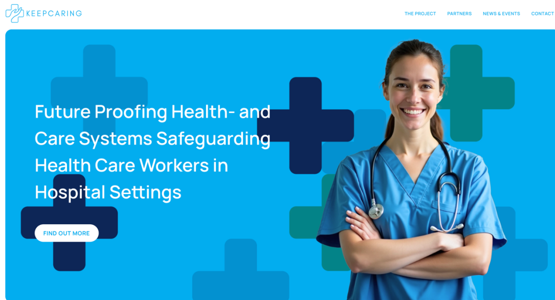
Figure 1 KEEPCARING Homepage

The homepage is structured as the central entry point for the website, providing a clear overview of the KEEPCARING project. Its main features include: