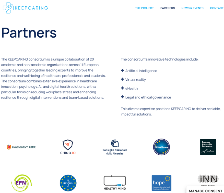
Figure 3 KEEPCARING Partners

This section introduces the partners and organizations involved in the KEEPCARING project.